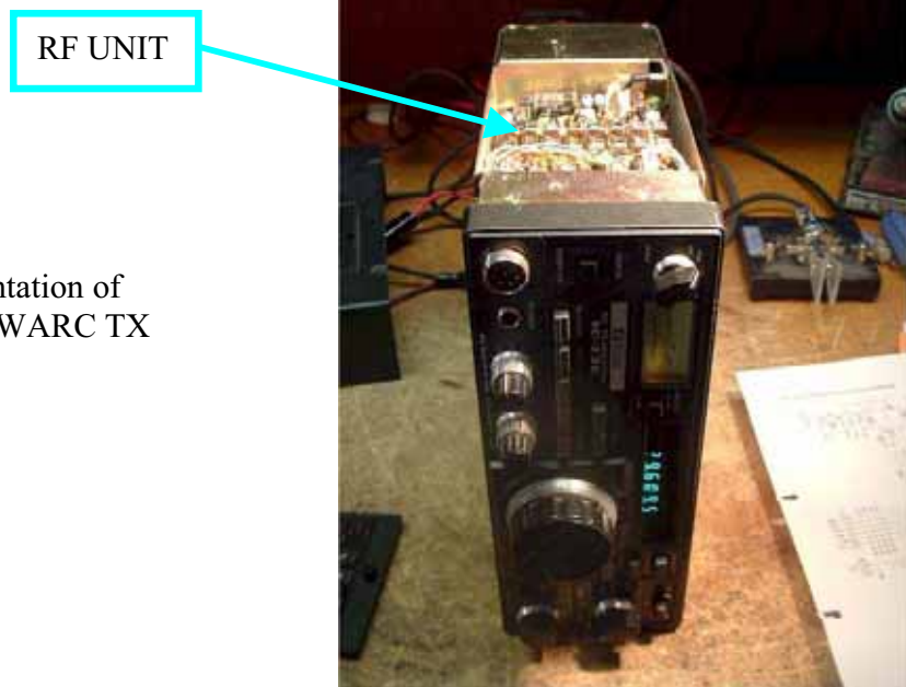
Fig. 1 Orientation of IC-730 for WARC TX mod